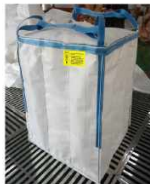
FIBC TYPE B