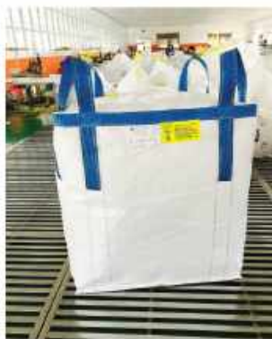
FIBC TYPE B