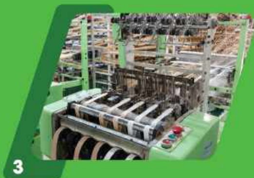
Weaving loops machine