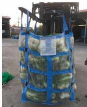
MESH BIG BAG