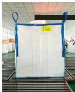
FIBC TYPE B