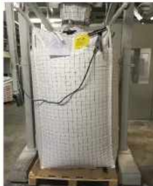
FIBC TYPE C