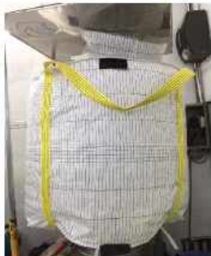
FIBC TYPE C