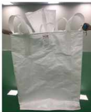
FIBC TYPE A