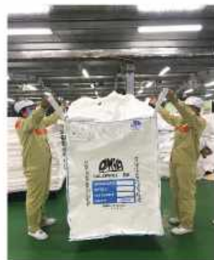
FIBC TYPE A