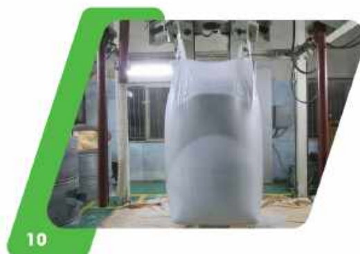
10 Stacking test machine