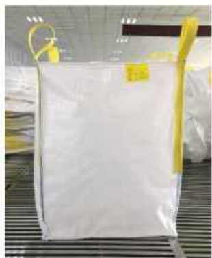
FIBC TYPE B