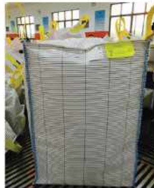
FIBC TYPE C