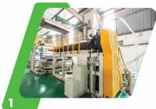
Yarn extrusion machine, capacity 320-650 kg/h