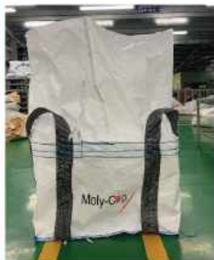
FIBC TYPE A