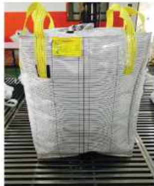
FIBC TYPE C