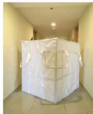
BIG BAG PALLET