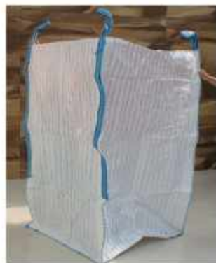
VENTILATED BIG BAG