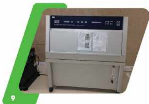
9 UV testing machine