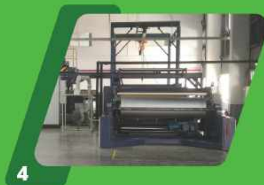
Lamination machine (1 side), capacity 80-150 meter per minute