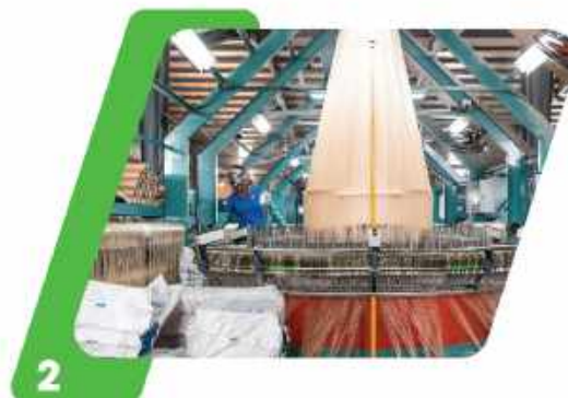
Circular loom machine, 900mm – 2500 mm width