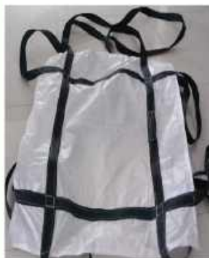
BIG BAG PALLET