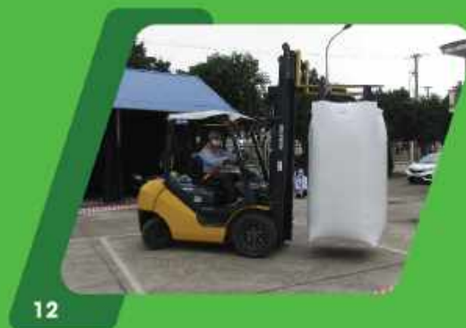
12 Lift testing machine