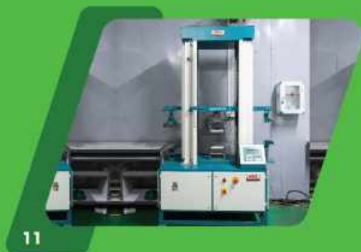
11 Tensile testing machine