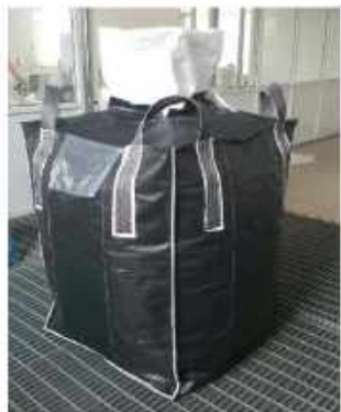
FIBC TYPE A